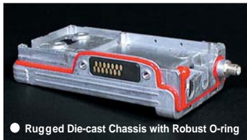
● Rugged Die-cast Chassis with Robust O-ring

The VX-800's ruggedness begins with its one-piece die-cast aluminum chassis, which provides high strength and durability along with light weight. Surrounding the portable's circuitry is a one-piece high-impact case, sealed against water ingress by a robust O-ring.