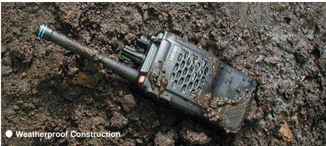
● Weatherproof Construction

Built to meet or exceed the requirements of the U.S. MIL-STD 810 C/D/E standard, the VX-800 is designed to survive under difficult operating conditions of shock, vibration, and driving rain. Cost-performance begins with durability, and the Mil-Spec toughness of the VX-800 is your guarantee of its design quality.