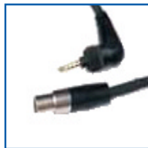
Cable for Peltor earprotector