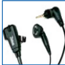
Earphone with PTT/microphone