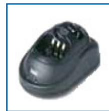
Quick/desk-charger Charge 2 batteries