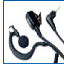
Earhook with PTT/microphone