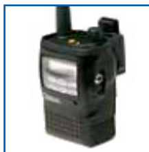
Leather case with rotateable click on hanger