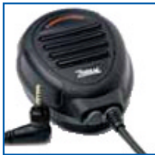
Waterproof speaker microphone