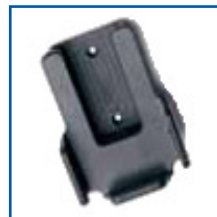
Holder for cars/trucks