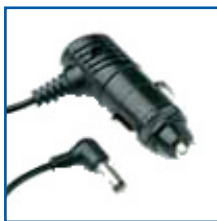
12V cable for desk charger