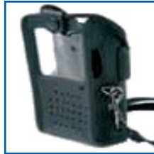
Carrying case with sling