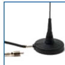
Antenna packet for cars/trucks