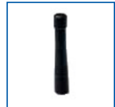
Short antenna 7cm/10cm 400MHz