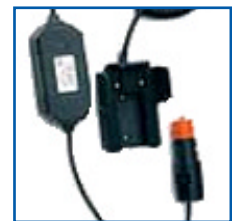
12/24V cable with holder